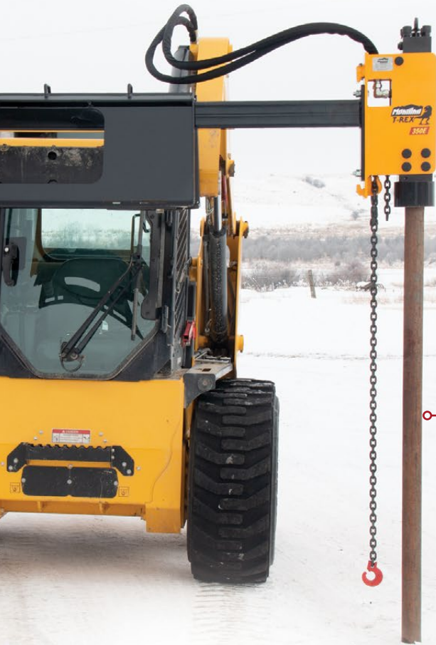
Side Extension T-REX 350E

The ORIGINAL Hydraulic Hammer Post Driver